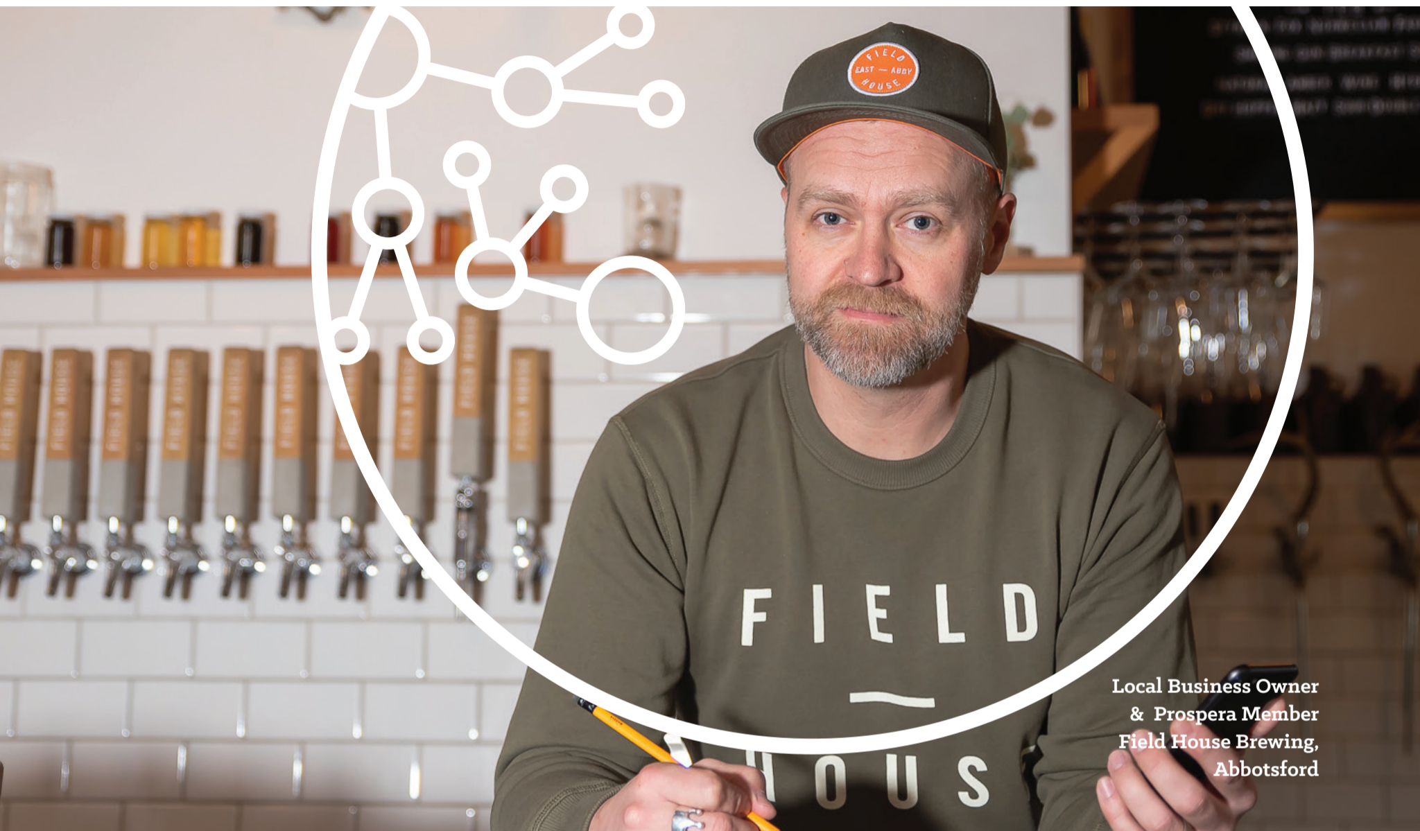
Local Business Owner & Prospera Member Field House Brewing, Abbotsford