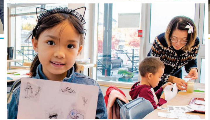
Central Okanagan Food Bank Evergreen Cultural Centre Society

Thank you for providing such a rich learning experience for children in a fun and welcoming environment. My daughter and I have loved coming by to explore the exhibitions and participate in Family Days. The staff is excellent, the activities use high-quality materials, and we both come away with great memories and our own art pieces! During the pandemic, the gallery had all the necessary safety protocols in place to participate in person (while being distanced from other families). I am very grateful to have this wonderful resource in our community!